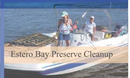
Estero Bay Preserve Cleanup