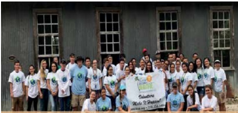
Global Youth Services Day