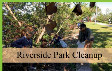
Riverside Park Cleanup