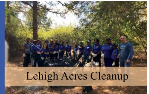
Lehigh Acres Cleanup