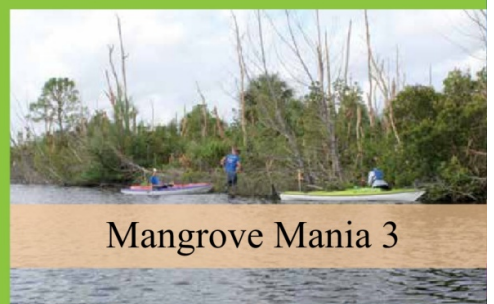
Mangrove Mania 3