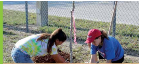
Cape Coral HS Tree Planting