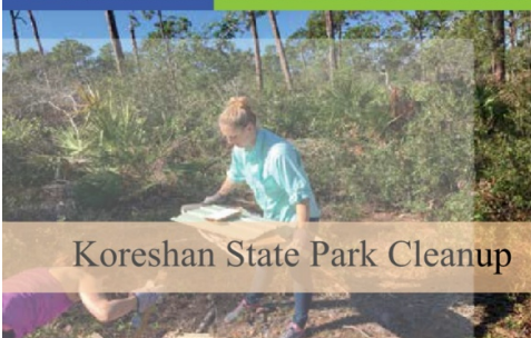
Koreshan State Park Cleanup