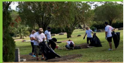
Oakridge Cemetery Cleanup