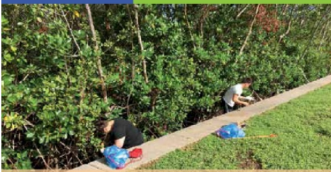
Centennial Park Cleanup