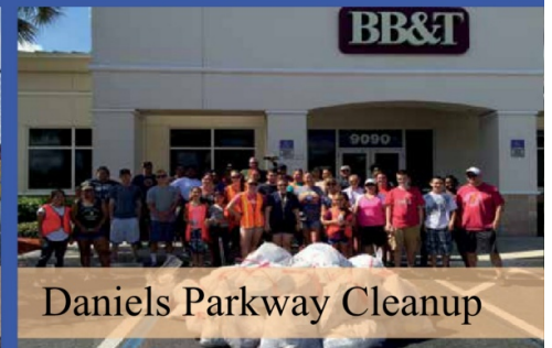
Daniels Parkway Cleanup