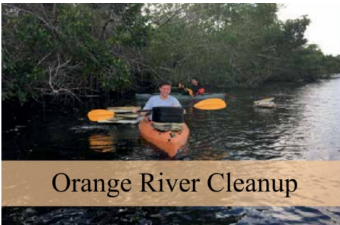
Orange River Cleanup