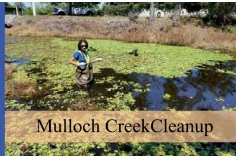
Mulloch Creek Cleanup