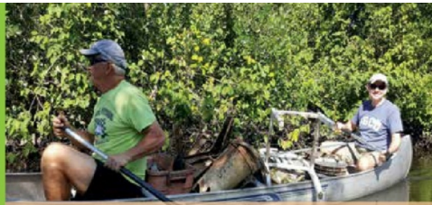
Billy's Creek Cleanup