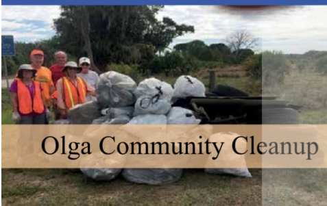
Olga Community Cleanup