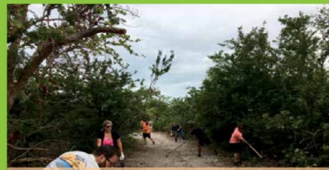
Lovers Key State Park Cleanup