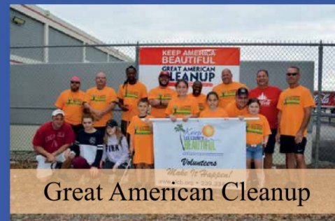
Great American Cleanup