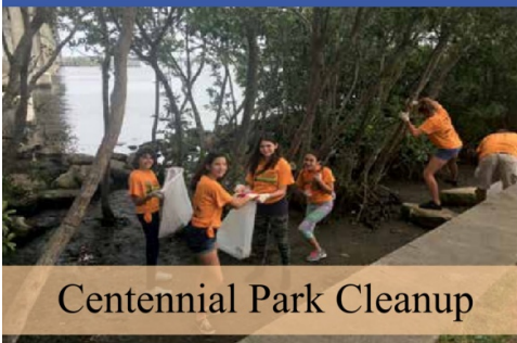
Centennial Park Cleanup